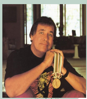
Billy Mills 1964 Olympic Gold Medal Winner